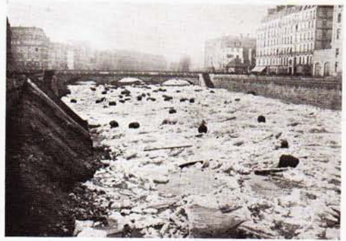
La Seine pendant l'hiver 1870-71 (tel qu'il-est).